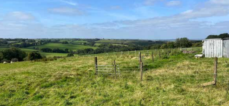
2.84 acres of land which benefits from direct road access off an unnamed country road. The land, down to permanent grassland also benefits from a small field shelter.

Trelaske, Lewannick, Launceston | Auction Guide Price £15,000 For sale by public auction - Wednesday 15th January