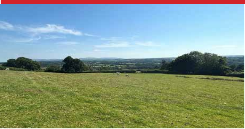
Just over 93/4 acres of gently sloping pasture land in a stunning location with parish road frontage and lane access.

Hatherleigh | Guide Price £120,000 - £140,000